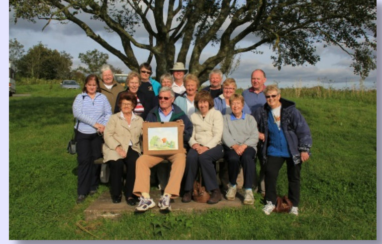
At the end of a days painting in Priddy we took a trip to Deer Leap so the group could see the amazing views, take some photographs and we took a group photo